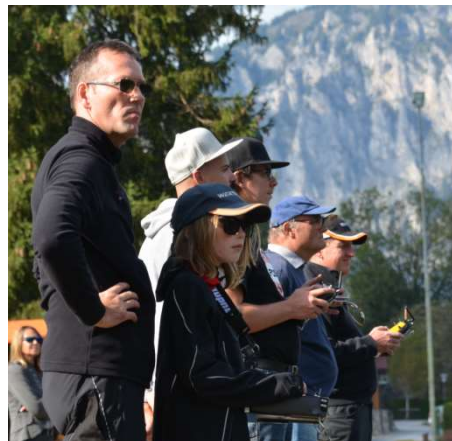
...eine neue Juniorin