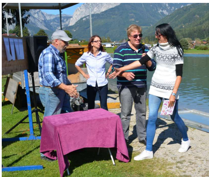
... die Organisatoren